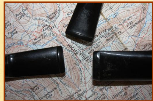
Step 1 & 2 (unfold)